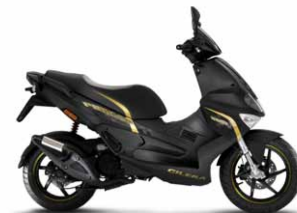
Nero Opaco (Special Series Black Soul)