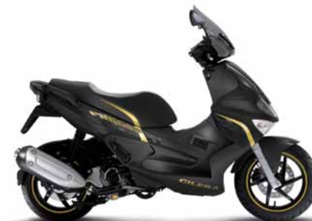
Nero Opaco (Special Series Black Soul)